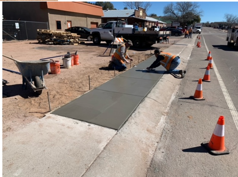
Concrete replacement on Main Street