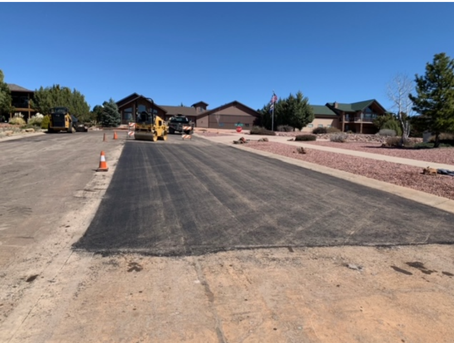
Cloud 9, 21 ton asphalt patch

Street Operations Division trimmed trees overhanging the roadways in Payson North and Alpine Heights earlier this month. In addition, the crews were able to complete some significant asphalt repairs on W. Cloud Nine Pkwy. where the existing surface was failing. The roads in this area have been a challenge to maintain due to soil conditions in that area. Lastly, sidewalk repairs were undertaken along W. Main Street to mitigate areas where the concrete heaved.