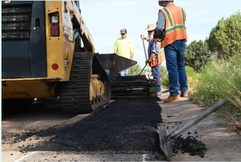
Leroy manages a grade controller on the screed as asphalt is dispensed into a patch on North Airpark Rd.

The Street Department continues into the heat of summer and negotiating unpredictable rainfall as we continue to rehabilitate and restore a few more spots in Mazatzal Mountain Airpark. The paving job is accomplished by our crews as early in the day as we can start to beat the heat and be as inconvenient to motorists (and pilots) as possible. We have been blessed as a town to have two talented fabricators on staff that designed and manufactured a special paving/shouldering machine to use on such projects as these.