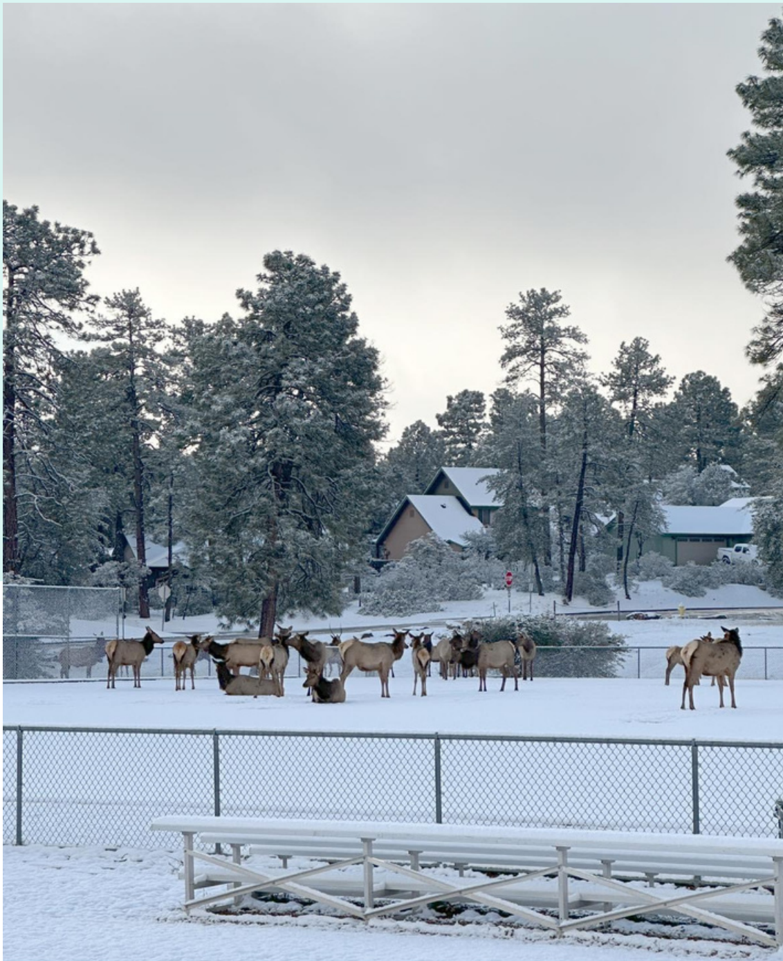
A HERD OF ELK ENJOYING THE FRESH SNOW ON THE SOUTH MULTI-PURPOSE FIELD.