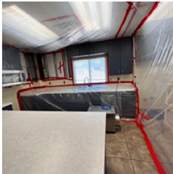
Station 12 kitchen mold removal