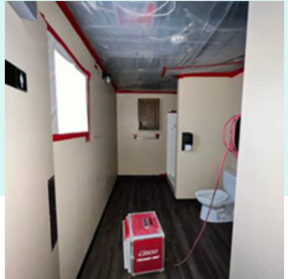
Station 11 upstairs bathroom ceiling mold removal