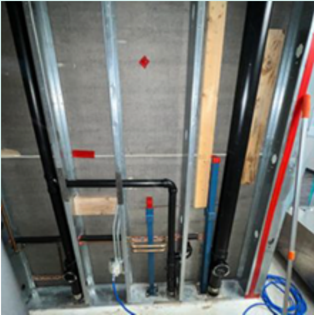
Station 11 electrical room