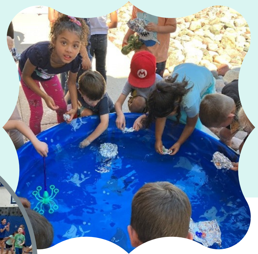
Pictured: Parks & Recreation Summer Camp program 7/23

We wrapped up our inaugural youth Summer Camp program. The program maxed out at 100 participants for July, and we are looking forward to expanding the program in the future! Due to the overall success and positive feedback from the program, we are now going to collaborate with Payson Unified School District for a similar program on Fridays throughout the school year.