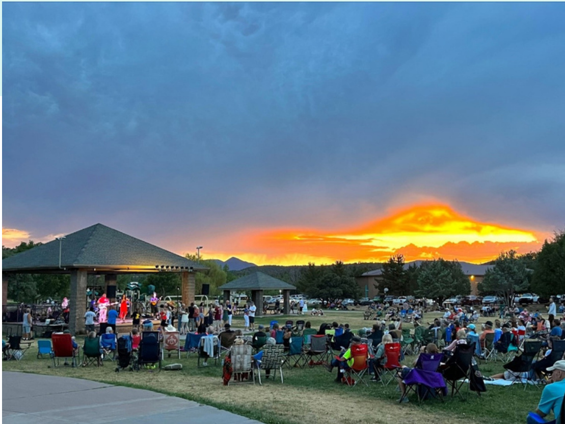
Pictured: Outside the Line 07/22/23

On the heels of the Community Fourth of July celebration, we hosted the final concerts to our Summer Concert Series. We had record numbers for the series, including over 1,750 people at one show, and we averaged over 1,100 attendees per show for the eight-concert series! Look for more live music at the Fiddle and Food Truck Festival coming in September!