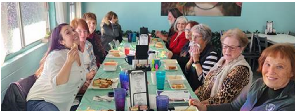
Volunteer Appreciation Lunch in January