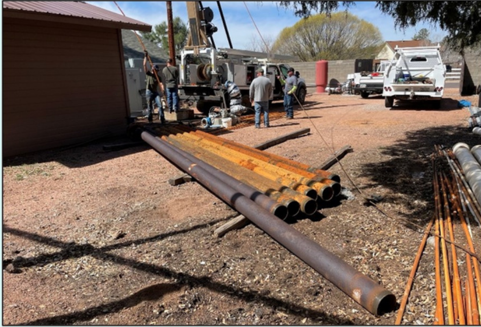
Removing column pipe from well