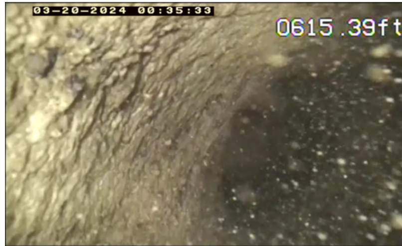
Open borehole (555-745 feet)