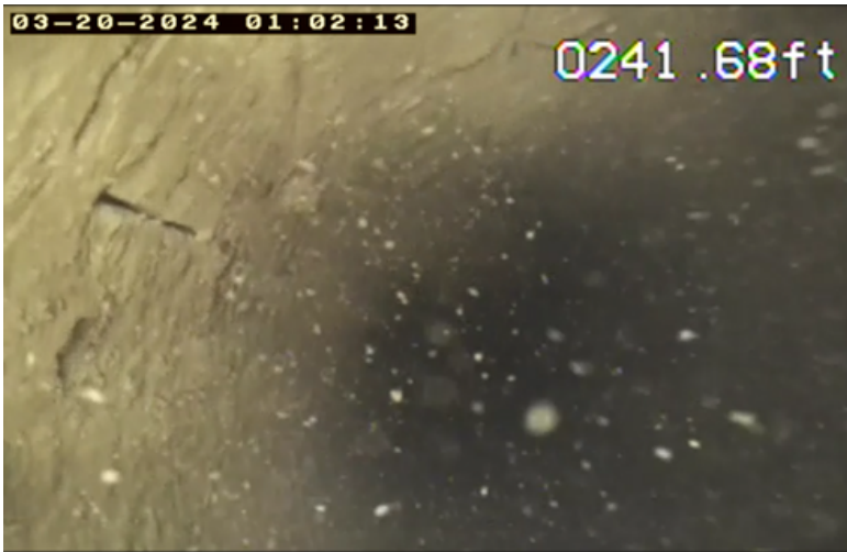
Open casing slots (60-555 feet)