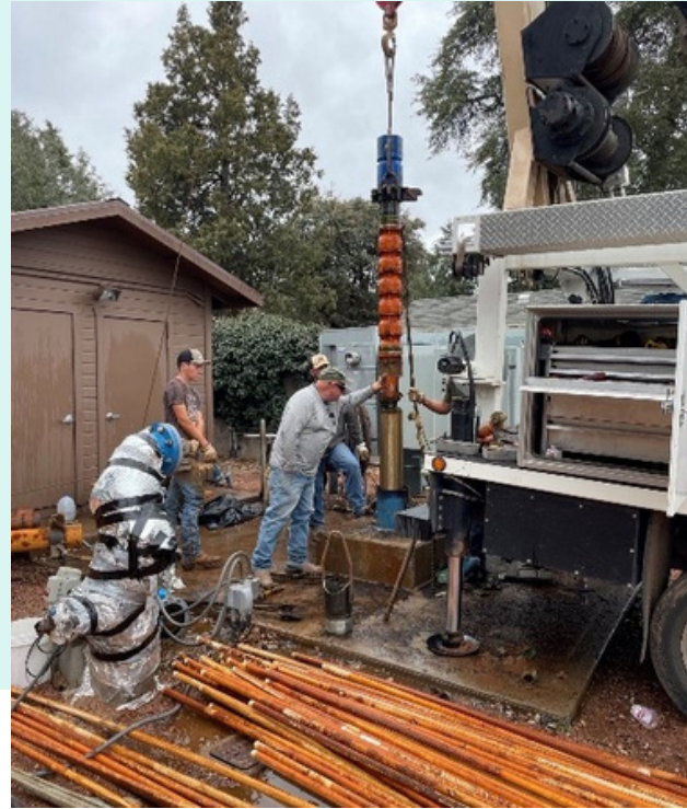
Submersible pump removal