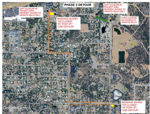
Phase 2 - Pony to Mud Springs (Estimated Schedule: October 7 - November 15)